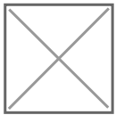
FIGURE 5. Mag-amp Audio Amplifier (push-pull).

The mag amp can even compute. Trouble-proof magnetic binaries replaced the less reliable vacuum tubes used in some early digital computers.